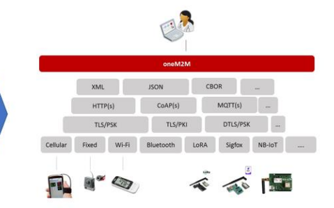
By implementing oneM2M CSL, at the device and the infrastructure side, the developer only uses the globally specified oneM2M APIs to push data from the device into the cloud.

Figure 1: Look at all the complexity that oneM2M avoids